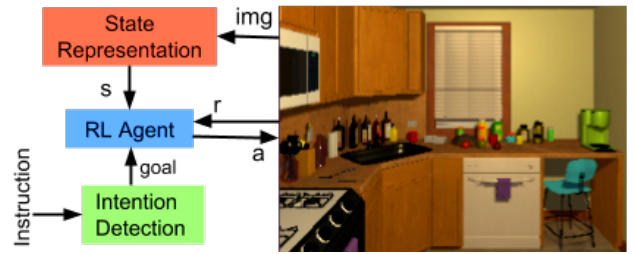
Fig. 1. The modular approach using intention detection and reinforcement learning trained for each objective to generate the sequence of actions[6].

We introduced a framework to obtain the intention of a given spoken instruction (e.g. “boil water”) and generate the sequence of actions (“moveto kettle”, “grasp kettle”, ...) to fulfill the task [5], [6]. We developed a symbolics environment from the “Tell Me Dave” Corpus [7] to train the RL agent. A distributed symbolic state representation reduced the learning time (about 4x) (e.g. {On Kettle Sink}, {Near Robot Sink}, ...) of the environment. In our case, the environment state was directly accessible through the simulation while this needs to be extracted in a real life scenario. Therefore, we will extend by encoding vision and instruction in a fused state similar to Shu et al. [8] in a more realistic simulator like AI2Thor [9] (see figure 1).